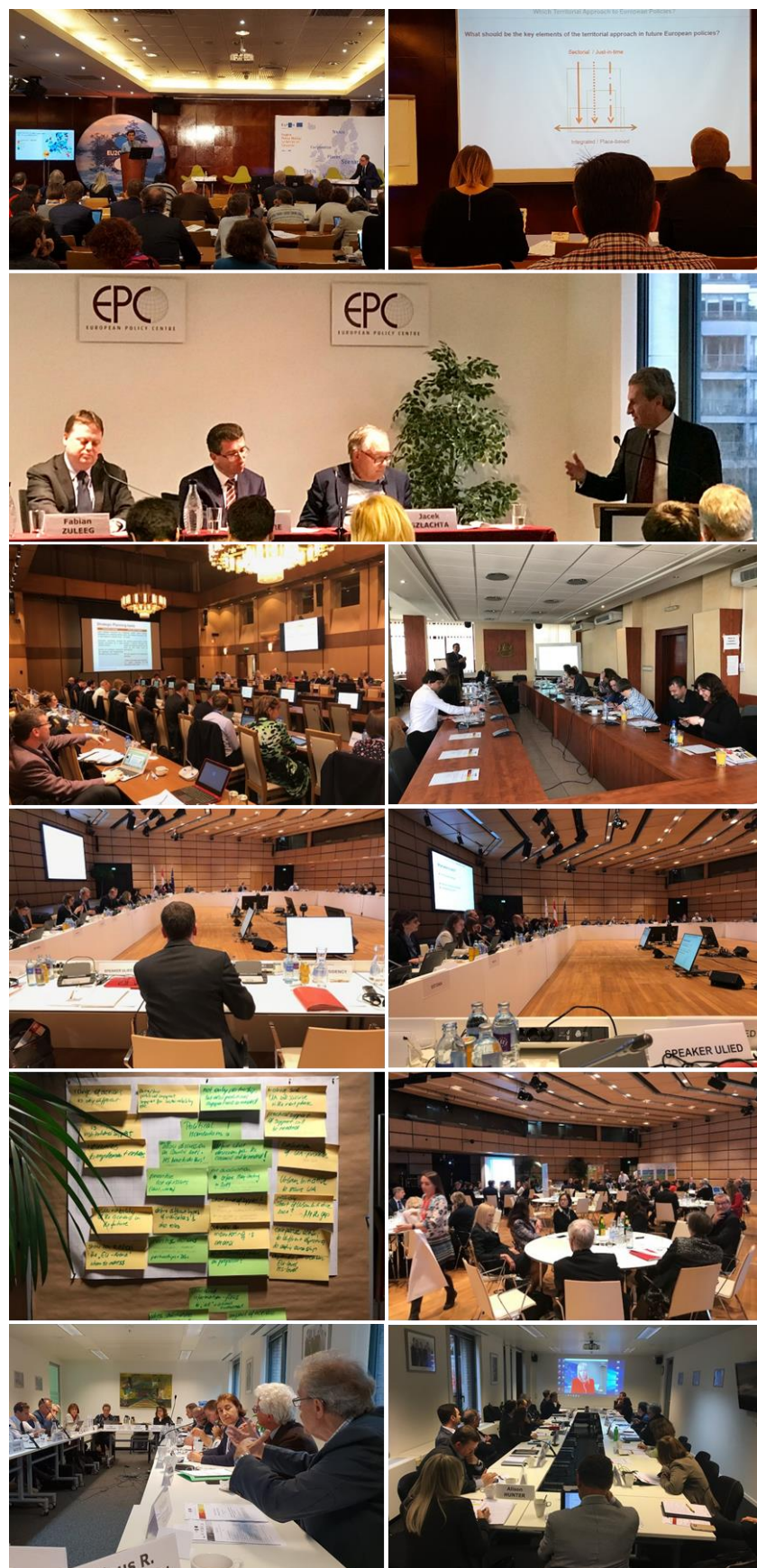
Figure 1: Sample of some SAF and NTCCP participatory activities carried out 2018-2019